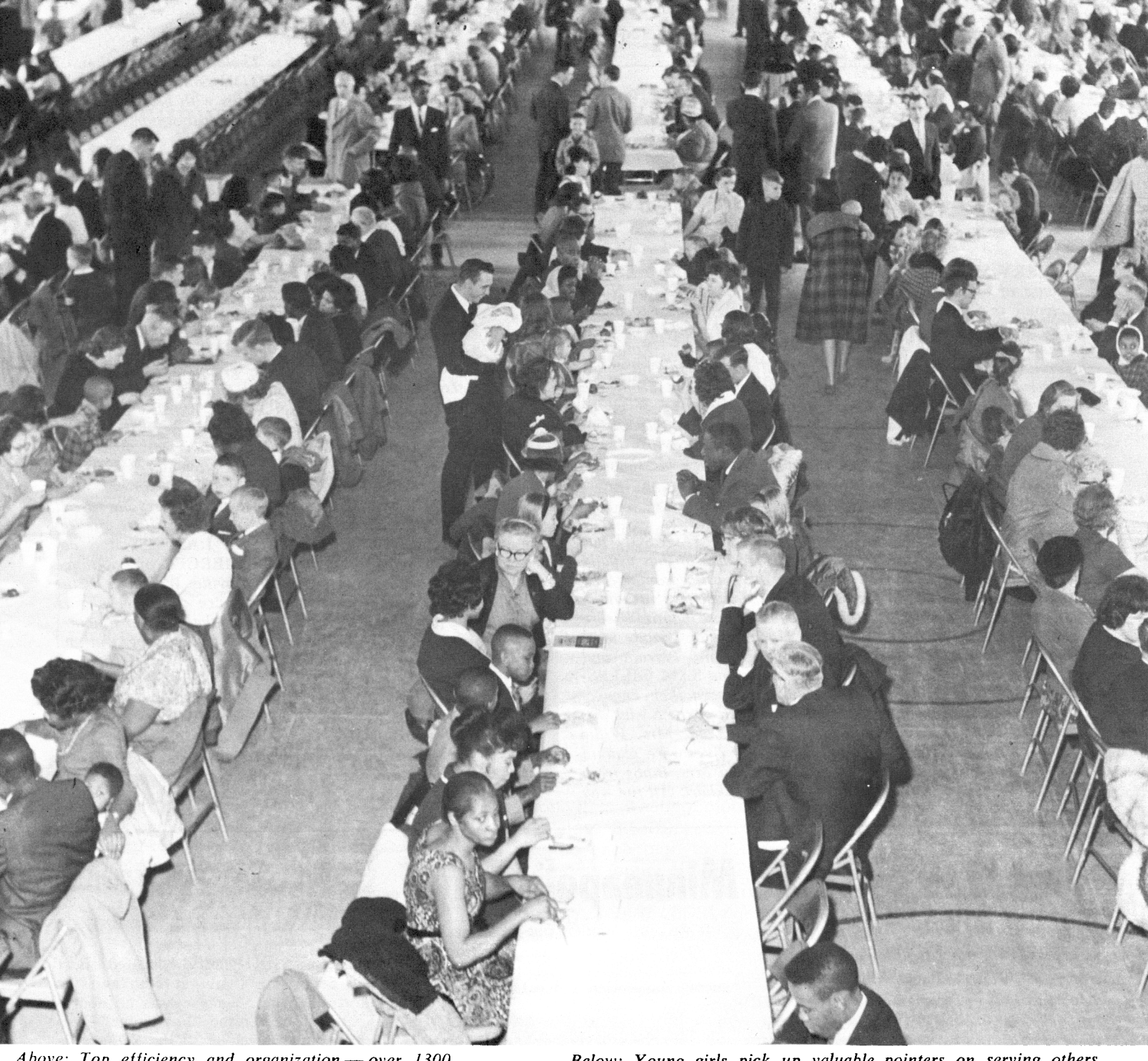
Above: Top efficiency and organization — over 1300 people fed at the Gary Armory in less than an hour.