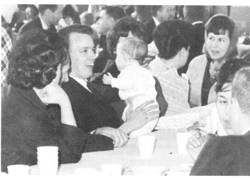
Babies certainly make me happy.